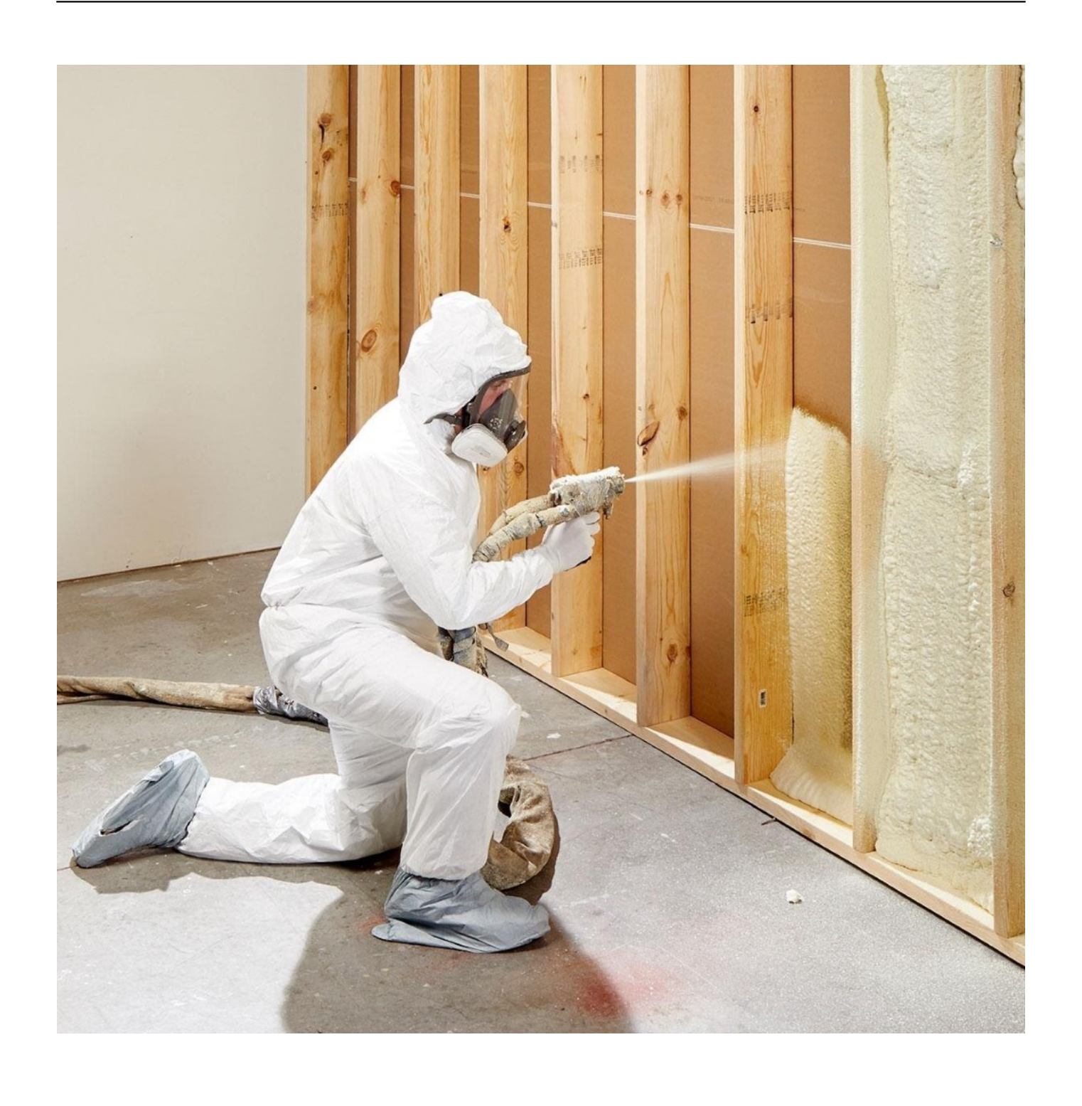
2 Part Foam Insulation- How To Work With It In Colder Temperatures